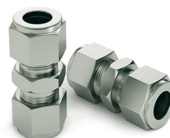
Tube Compression Fitting End Example