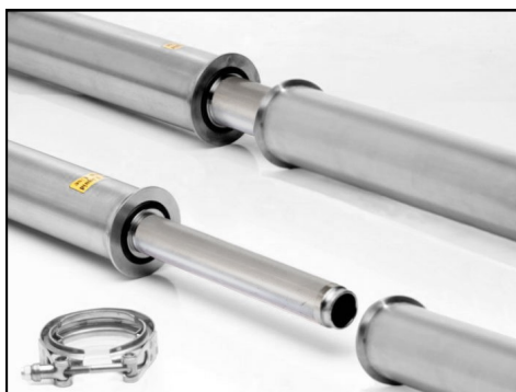
Easy to install bayonet connections.