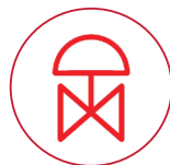
Emergency Shut Off Valves