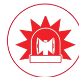
Horn & Strobe Lights