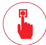
Emergency Shut Off Buttons